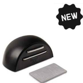
2034-8- matt black

With this new addition, the complete range would look like this: