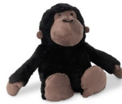
3186-8 (black gorilla)