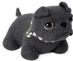
3185-7- (grey pug)

We are expanding our fabric door stop collection by incorporating four new models: