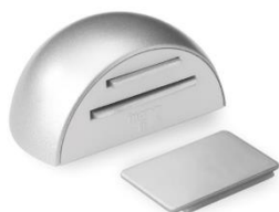
2034-7- matt chrome