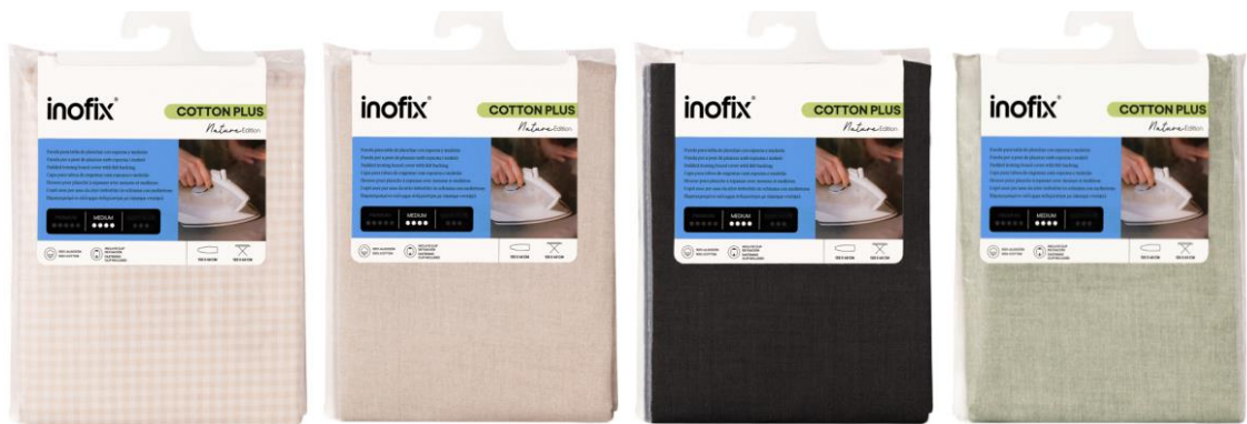
1343-B- (vichy) 1343-C- (natural linen) 1343-D- (black linen) 1343-E- (olive linen)

Digital printing has achieved a linen effect in three distinct colours, as well as another with a vichy checks.