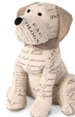
3189-2 (beige dog)

These fabric doorstops are perfect for preventing doors from slamming shut due to drafts.