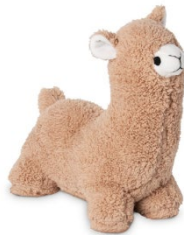
3188-6- (brown llama)