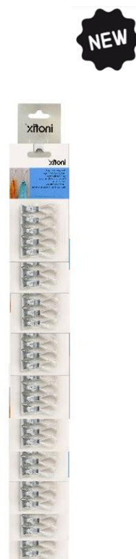
3009-2R- (white string)