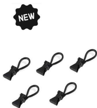
3009-3- (matt black)

With this new addition, the complete range would look like this: