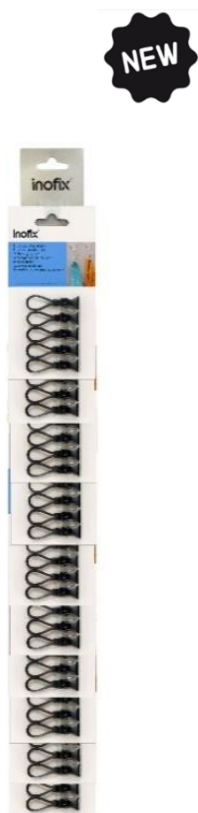
3009-3R- (matt black string)