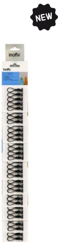
3009-3R- (matt black string)